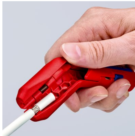
stripping of a coax cable