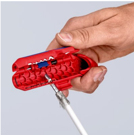
Stripping of a coax cable