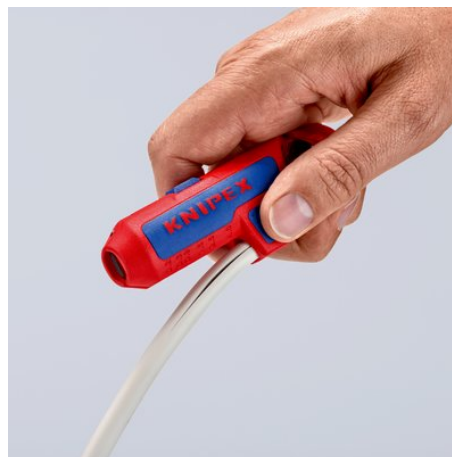
With concealed cutter in overhanging thumb rest on the side for convenient lengthwise cut